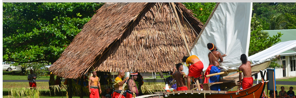
National Campus Palikir, Pohnpei