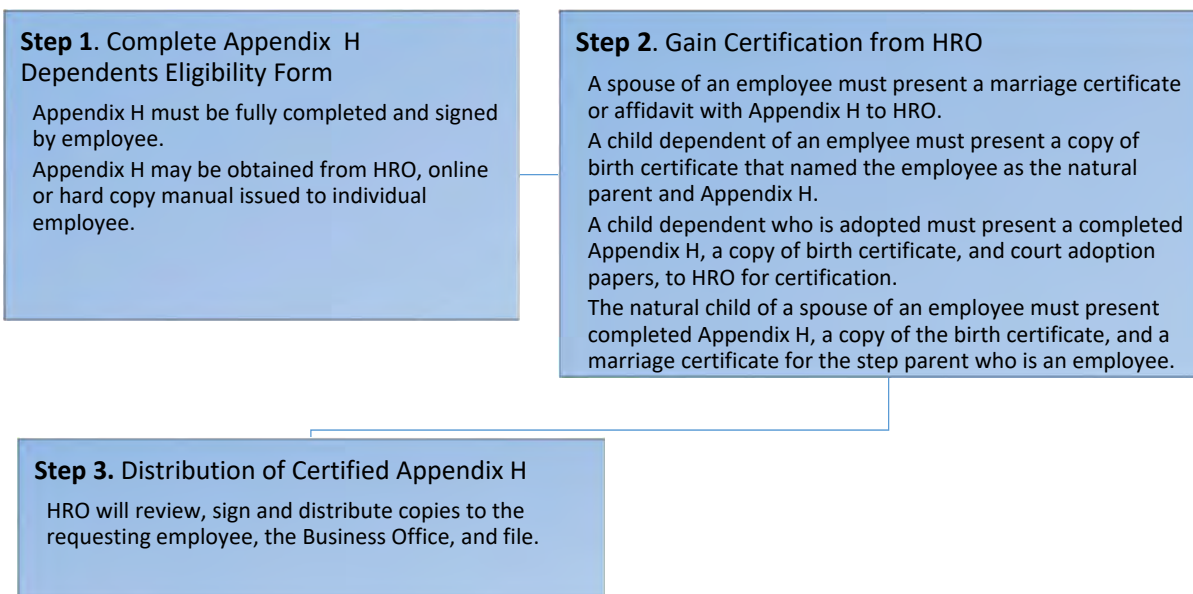
Figure 2.2. The Process for Dependents to Apply for Reduced Tuition