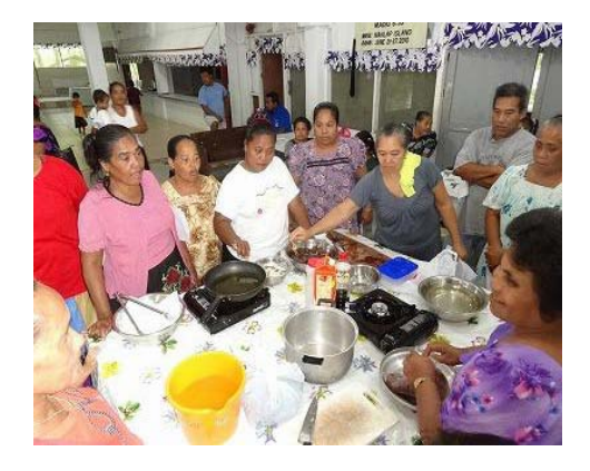
Pohnalamwahu- even the kids enjoy a day out as parents...cheering, learning new recipes for next meal