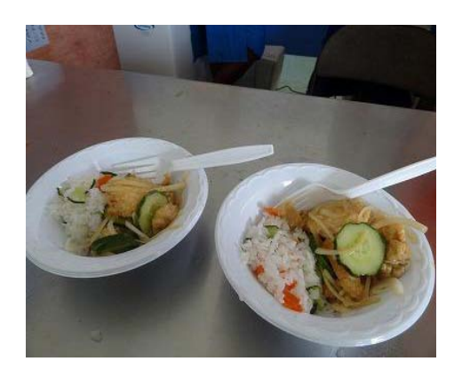
Cooking demonstration at YFA-Cooking Sushi-rice and Namban...enjoy because there is plenty to go around.

During the month, CES PNI, including JICA volunteer conducted 16 cooking demonstrations in different locations, including PNI and Yap. About 485 participants were in attendance not including children.