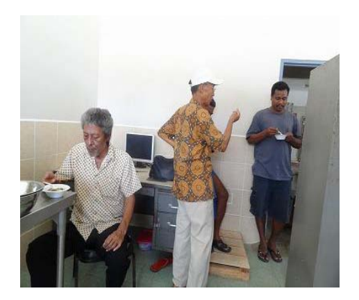
Cooking demonstration at Yap Fishing Authority(YFA... and yamyam! even in Yap. If you are interested, we are here to teach and demonstrate.