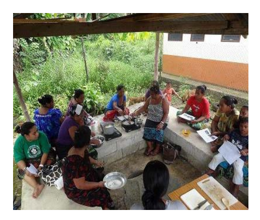
Sekere ECE- who says you can only learn in a well-to-do kitchen...EFNEP is flexible in learning environment.