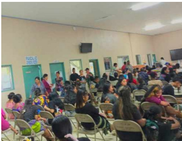
Students during the Induction of Officers