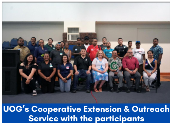
UOG's Cooperative Extension & Outreach Service with the participants