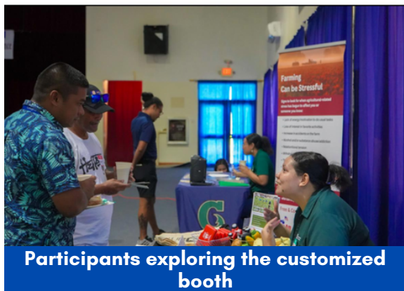
Participants exploring the customized booth