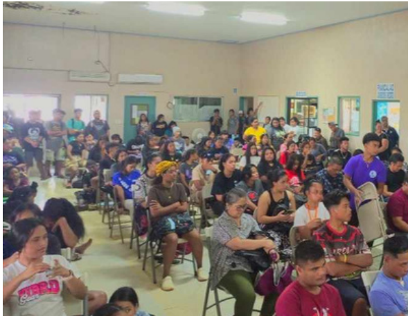
Students, Faculty & Staff at Student Hall