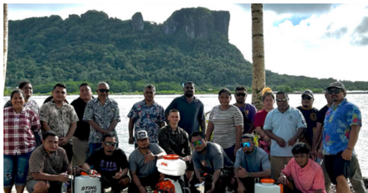
Pest Control Training Participants with Task Force Koa Moana