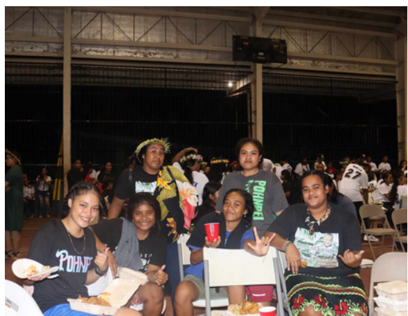
Freshmen during the Welcome Ceremony