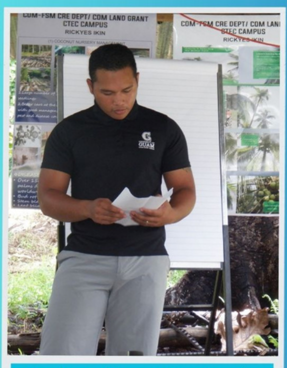
Graduated from University of Guam with a degree in Tropical Agriculture Production