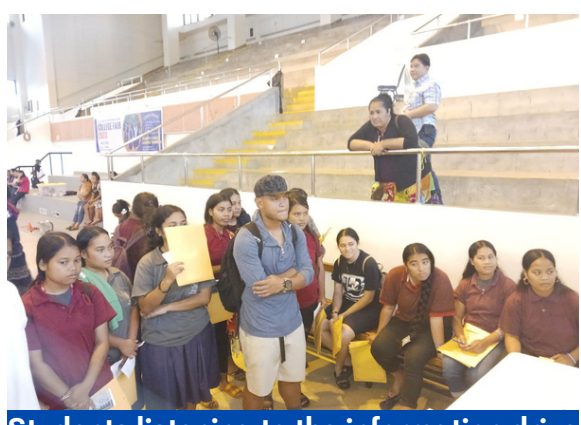
Students listening to the information drive