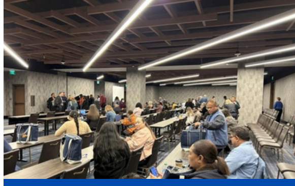
NERAOC Participants while on break