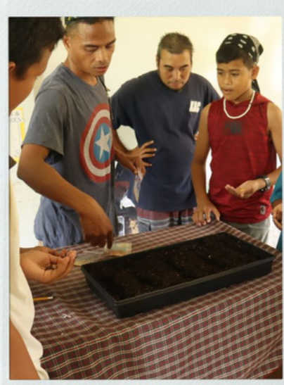
COOPERATIVE RESEARCH & EXTENSION (CRE) A COMPONENT OF COM-FSM LAND GRANT PROGRAM

CTEC Recognizes Faculty & Staff During the 2023 Incentive Awards