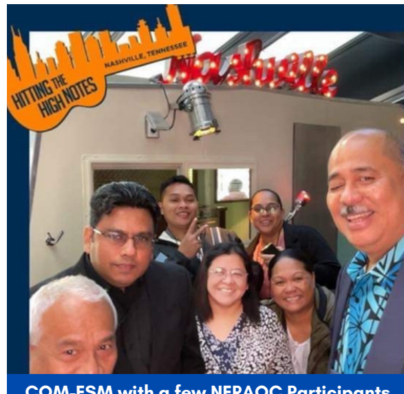
COM-FSM with a few NERAOC Participants

This conference had been administered by NIFA staff, breaking the conference down to 9 sessions in total excluding breakfast meetings, guest speaker experience and museum visits. In this conference, presenters were able to provide information about their own experiences to the audience. Their presentations were basically displaying issues that their universities had faced, and the solutions that they've formulated. Some of the sessions were more interactive than the others, for instance,