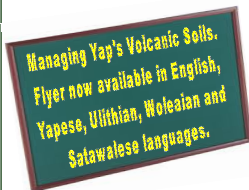
Volcanic red soils are the least fertile and most degraded soils in Yap