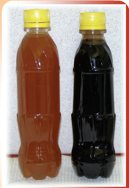
Freshly squeezed, unfermented juice is lighter colored (left) and reported to be higher in sugars than drip-extracted, fermented juice (right). Fully fermented juice is highly acidic and pH ranges between 3.0 and 3.5.

For more information on noni juice production, please contact Agricultural Experiment Station.