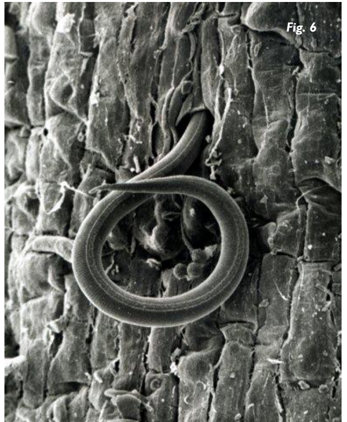
Whip like larva of root-knot nematode, magnified 500 times, shown here penetrating a tomato root. Once inside, the larva establishes a feeding site, which causes a nutrient-robbing gall.

feed on the outside and inside of susceptible plant roots (Figure 6).