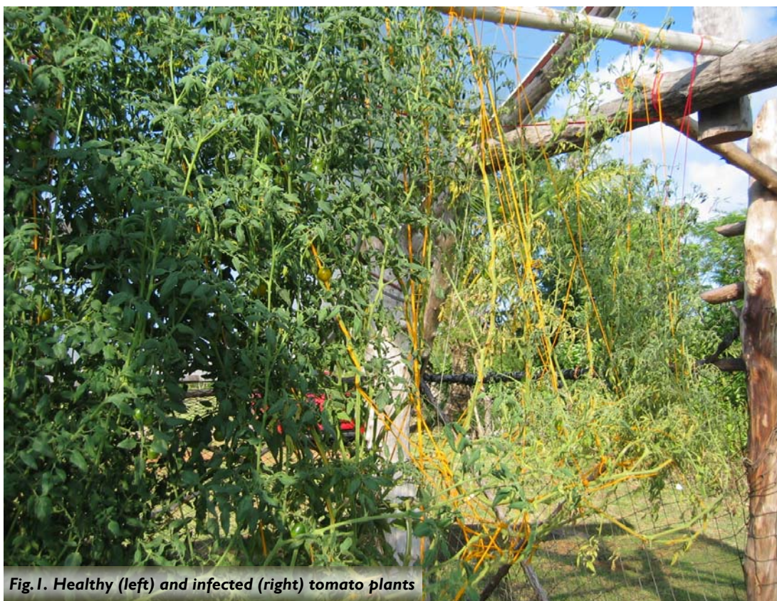
Fig. 1. Healthy (left) and infected (right) tomato plants

The extent of damage caused by root-knot