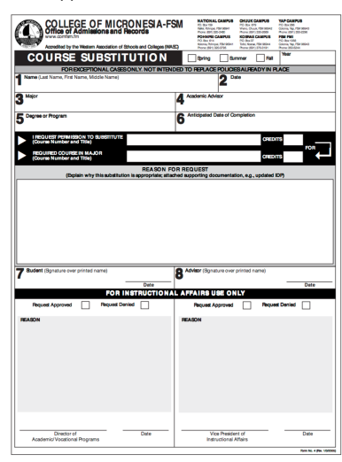
Figure 4.0. The course substitution form. The form may also be downloaded from <a href="http://www.comfsm.fm/?g=OAR-forms">http://www.comfsm.fm/?g=OAR-forms</a>.