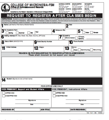
Figure 9.0. Request to Register After Classes Begin Form. This form may also be downloaded from http://www.comfsm.fm/oar/forms/ late_registration.pdf