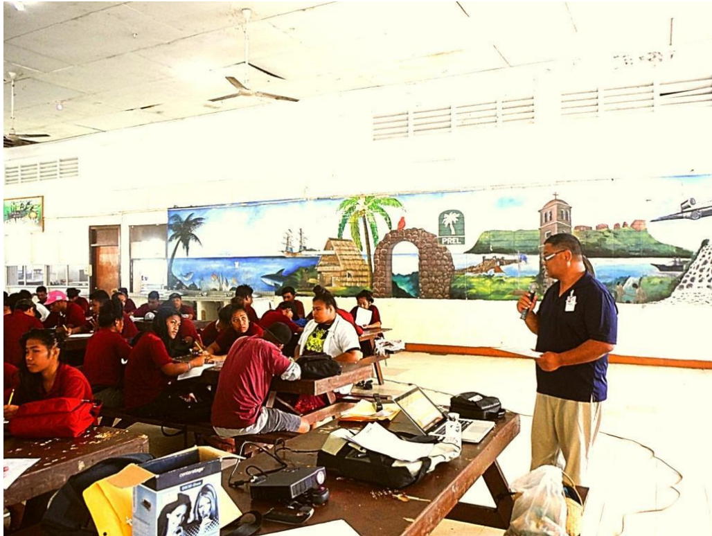
FAFSA Workshop at PICS High School, 2018