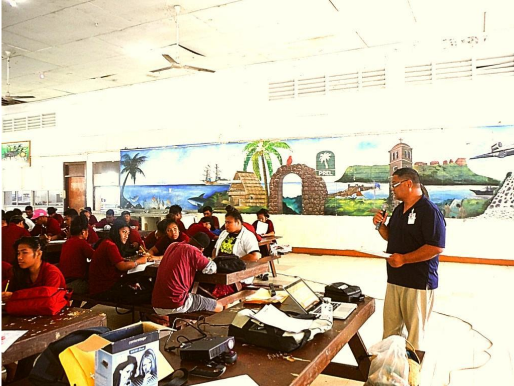
FAFSA Workshop at PICS High School, 2018