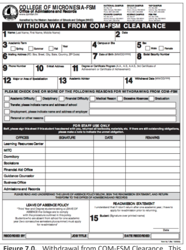
form may also be downloaded from http://www.comfsm.fm/oar/forms/withdrawal_cleara