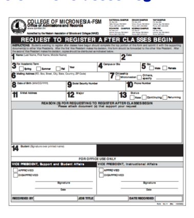
Figure 9.0. Request to Register After Classes Begin Form. This form may also be downloaded from http://www.comfsm.fm/oar/forms/late_r

Students are encouraged to register for classes subject to the dates and deadlines established in the academic calendar. However, students may register for open classes during the late registration period (or after classes begin) by completing the request to register after classes begin form (see Figure 8.0) and having it approved by the (a) vice president for instructional affairs, and the (b) vice president for enrollment management and student services.