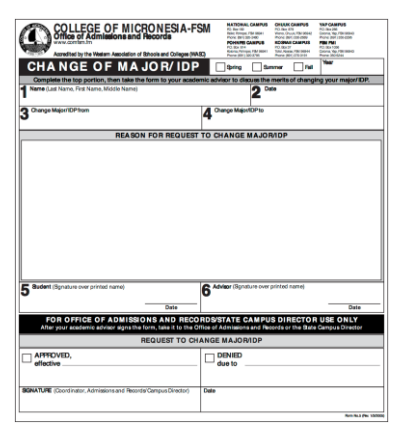
Figure 5.0. The change of major form. This form may also be downloaded from http://www.comfsm.fm/dev/oar/oar_forms/chang