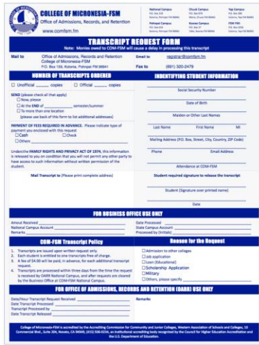
Figure 8.0. Transcript Request form. This form may be downloaded from

http://www.comfsm.fm/dev/oar/oar_forms/transcript %20request%20from.pdf