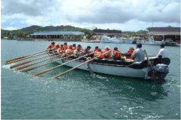
Trainees rowing the Cutter boat Nautilus