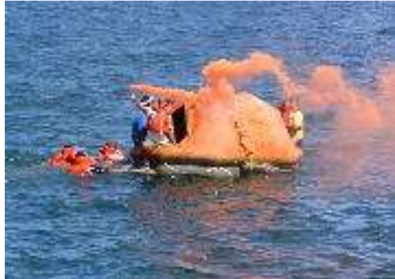
Trainees having practical in Survival