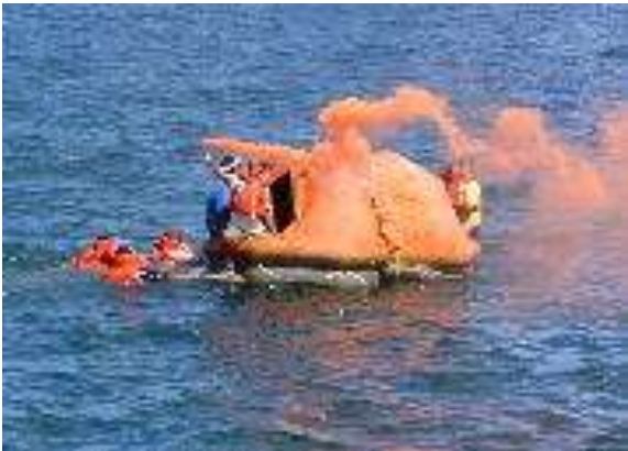
Trainees having practical in Survival