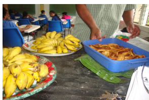
Parent in-kind contributions for GEAR UP after-school program: refreshment initiative

GEAR UP students have a big workload. They attend the regular classes and participate in the GEAR UP after-school program. It is not easy to keep focus for so many hours. To ensure that students participate in the after-school program and stay focused, one great initiative was supported by parents—the after-school refreshment program. GEAR UP parents provide snacks, such as bananas, soup, and donuts so that their children are not with empty stomachs and can effectively participate in the program. GEAR UP staff wishes to kindly thank parents and schools that support this initiative.