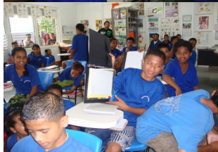
Students organizing their own binders