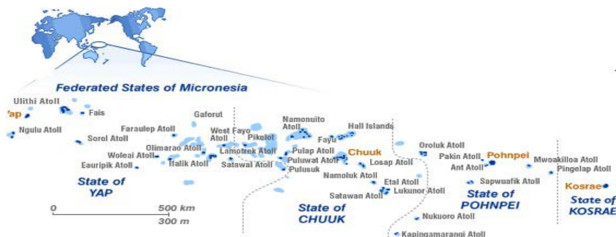
Figure 2. Details of the Federated States of Micronesia

Once autonomous from the larger College of Micronesia, the COM-FSM Board of Regents created an ambitious vision for higher education as a strategy to develop the employment capacity of Micronesian citizens. In the 1994 - 1998 strategic plan it was envisioned that the four continuing education centers on Pohnpei, Chuuk, Yap, and Kosrae would each become comprehensive community colleges and the former Community College of Micronesia located in Pohnpei would become a baccalaureate-degree granting institution for the FSM. The Board renamed the CE Centers to COM-FSM Campus (state) to reflect this new mission. As a result, each state campus practically operated independently. Due to fiscal limitations, this plan has been adjusted to the current status of one college – the College of Micronesia-FSM – with six sites on four islands: a comprehensive community college (referred to as the National campus) in Pohnpei, four state campuses, and the specialized FSM Fisheries and Maritime Institute. In addition to physical fragmentation, the large distances between the islands and the increase in student population, this new mandate has created administrative challenges for the College. The recommendation of the commission to strengthen the line of authority for instructional and student services policies and implementation has caused the college to reconsider the roles of the senior administration and support personnel