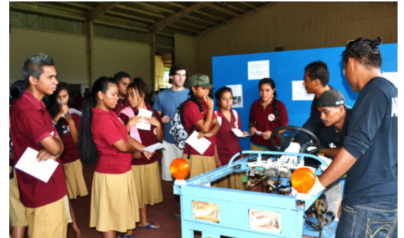
High school students checking out the Motor Vehicle Mechanics program exhibit.

COM-FSM Pohnpei Campus successfully held the 2013 Skills Expo at the Pohnpei Campus gymnasium on April 25 and 26, 2013. Pohnpei Campus showcased nine (9) instructional programs which include: Agriculture and Food Technology, Building Technology, Carpentry and Cabinet/ Furniture Making, Construction Electricity, Electronic Engineering Technology, Hospitality and Tourism Management, Motor Vehicle Mechanics, Refrigeration and Air Conditioning, and Telecommunication Technology. Booths were available with demonstrations and displays of either finished products or mock-ups of their respective programs. Exhibits ranged from hand crafted furniture made of local wood, cooking demonstrations, dining table