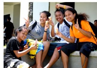
Students having fun during the Ice Cream Social activity at National Campus

day activities. "We want to know through the voice of the students if we did good or not with the efforts during the founding day" says Tairuweyip. Survey forms were handed out to students while they