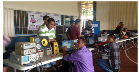
Top: Electronic Engineering Technology students showcasing their exhibit. Bottom: Hotel and Tourism Management Students at their exhibit.