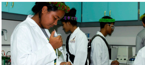
National Campus Students at the newly opened STEP-UP Laboratory.