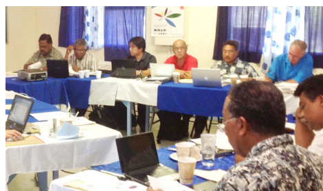
The Board of Regents together with the administrators of the college met during the board meeting last January.

15. The Board approved the Board of Regents Strategic Institutional Outcomes