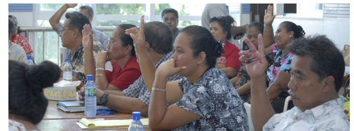
Parents, alumni of the college, and concerned citizens attend the community meeting.