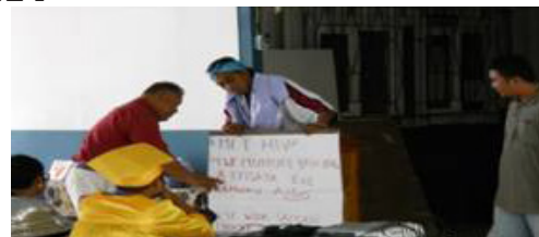
Chuuk Campus students during the STI / HIV awareness campaign.

The College of Micronesia-FSM Chuuk Campus held a successful awareness campaign on STI and HIV for Chuuk Campus students. According to the Chuuk Campus Nurse, Marcelly Mariano, many students showed up for the awareness campaign making it a successful event. The Chuuk State Public Health staff were at the campus to conduct presentations for students. Students also received demonstrations on how to properly use protection devices such as condoms. The students asked for clarifications on many areas such as the methods for transmitting the infections, the symptoms, treatments options, complications, and prevention methods. The students also