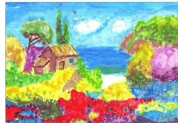
A sample drawing exercise from the students titled: Cool & Warm Colors