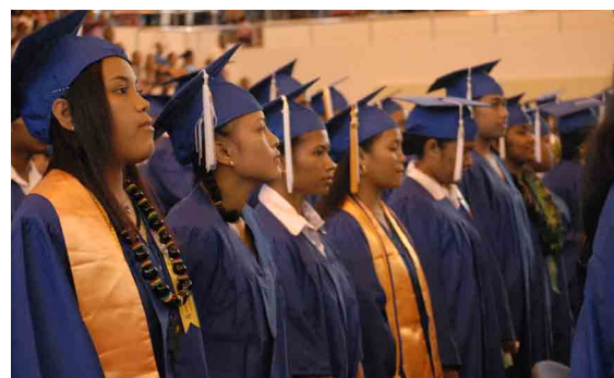
Graduates from National & Pohnpei Campuses at the 55th Commencement Exercises.