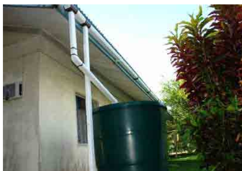
A sample of a rain catchment system

Rainwater is an essential source of drinking water on many islands of the Pacific. Despite the widespread use of rain catchment systems, evidence suggests most catchment systems are poorly constructed and not properly maintained. Available safe drinking water is a problem in Palau, FSM, and the Marshall Islands. Environmental exposure of one or more of the system components (1) collection surface, typically the household roof (2) conveyance component, gutters or pipes or (3) storage tank would render the typical catchment system susceptible to microbial contamination (bacteria, protozoa, and viruses). For rainwater catchments to be safe and effective users required an understanding of the best construction techniques and materials, potential water contaminants, how to test for contaminants, and effective decontamination methods. The 'first-flush divergent' consists of an additional component to the rainwater catchment on the house. The additional component diverts the first flush of rain