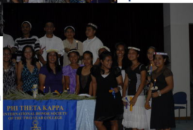
Society members after induction ceremony