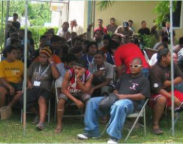
Youth participants at Yap Campus for visit

admissions requirements, and financial aid. They visitors were given tours of the campus. The youth were attending the 2nd Yap State Youth Summit at the Colonia Community Center from July 5th – 9th.