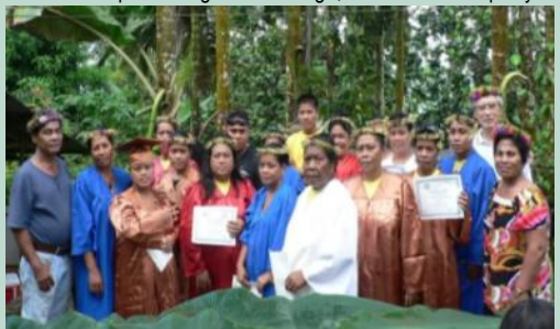
Rohi EFNEP training completers with CES staff and the JICA volunteer.

The CES Agents and a JICA volunteer conducted a week long training on Expanded Food and Nutrition Education Program (EFNEP), home gardening, and food processing in Rohi village, within the municipality