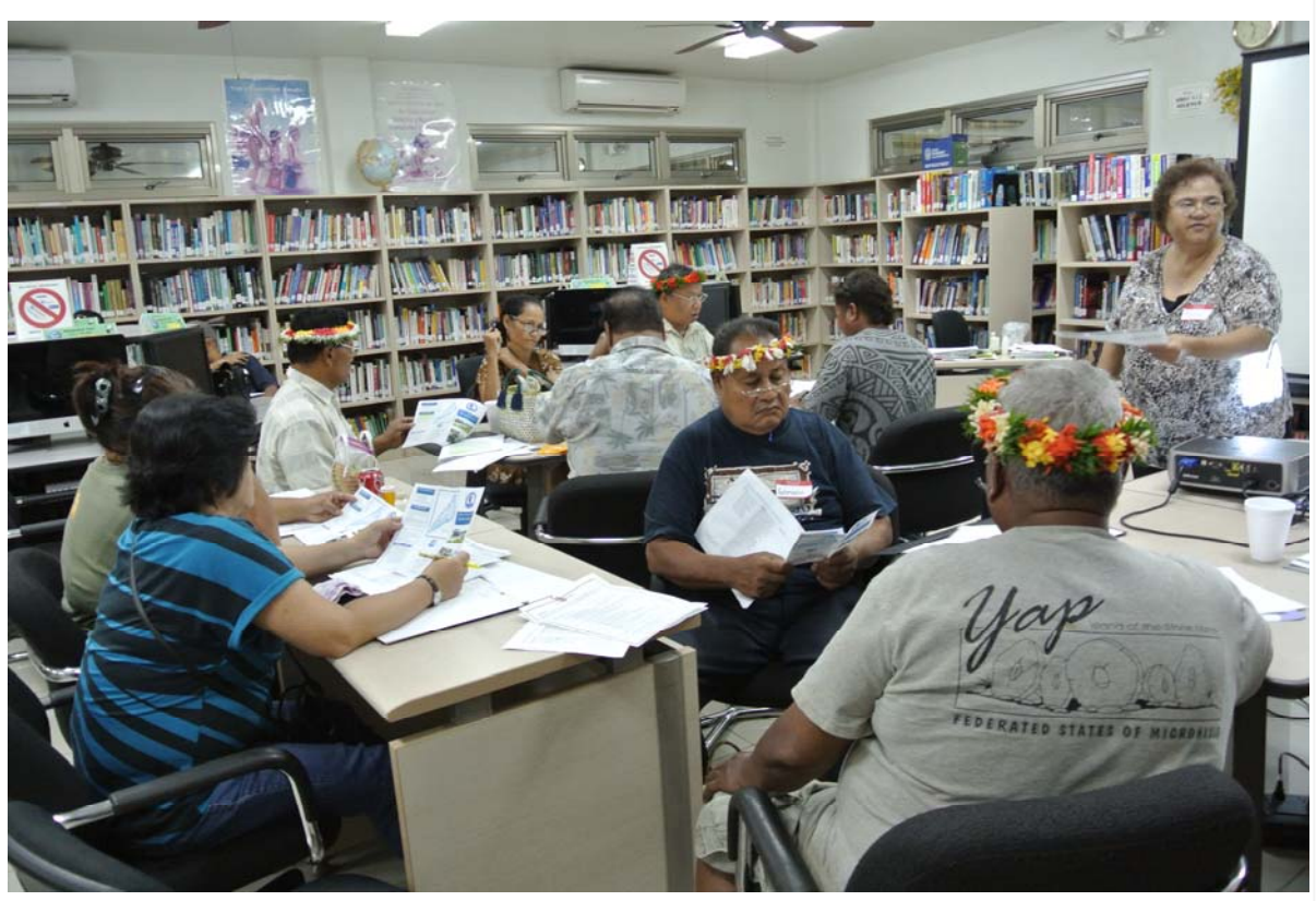
Appendix 6 Glimpses of the mini visioning summit