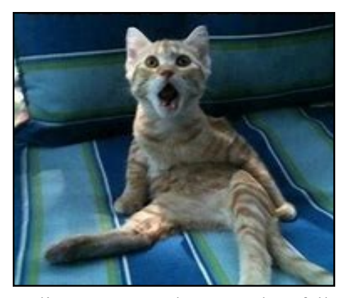
Policy 03-18 = When a student falls asleep in class, the instructor has the right to take all the student's clothes off and throw them into the ocean.

The Dean issued these new policies on June 4, the first day of summer instruction. If any student wishes to complain about the policies, just máfenpuch. \Theta