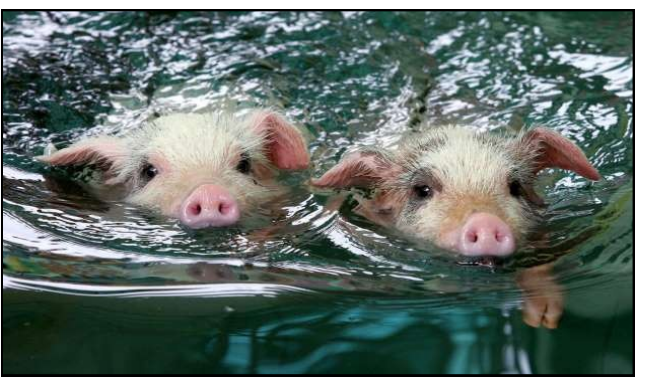
Policy 04-18 = Swimming beyond the seawall is prohibited. All violators will be slaughtered and eaten at the next All-Campus Meeting.

The Dean issued these new policies on June 4, the first day of summer instruction. If any student wishes to complain about the policies, just máfenpuch. \Theta