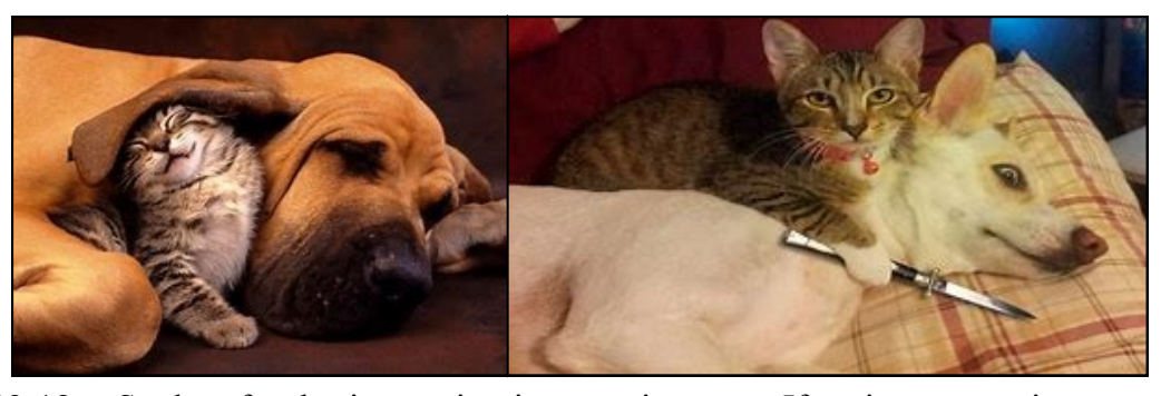
Policy 02-18 = Student-faculty interaction is a requirement. If an instructor gives a student a letter grade of F, the student has no right to kill the instructor.

Policy 01-18 = All students will sit on the toilet seat, not in the toilet bowl. If you mess it up, you will be required to clean the entire bathroom at your own expense.