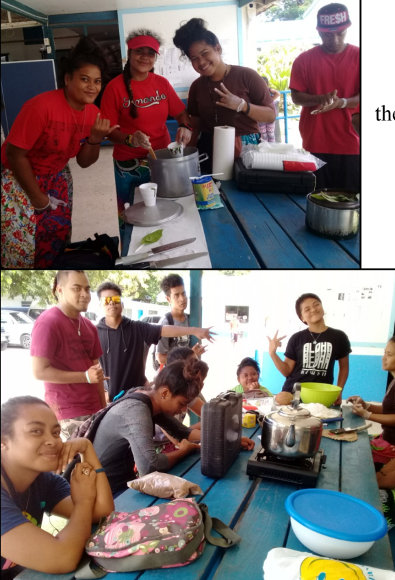
Demonstrating their cooking prowess...