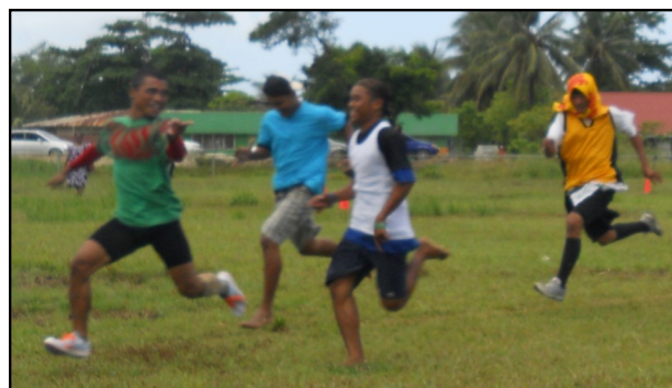
Running away from the girls

(1) Palau: NGERULMUD (not Koror) (2) Guam: HAGÄTNA (not Aghana) (3) CNMI: SAIPAN (4) Yap: COLONIA (or Rull-Weloy) (5) Pohnpei: KOLONIA (not Palikir) (6) Kosrae: TOFOL (not Lelu) (7) Marshalls: MAJURO (8) Nauru: YAREN (9) Kiribati: SOUTH TARAWA