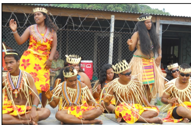
Doing their cultural thing