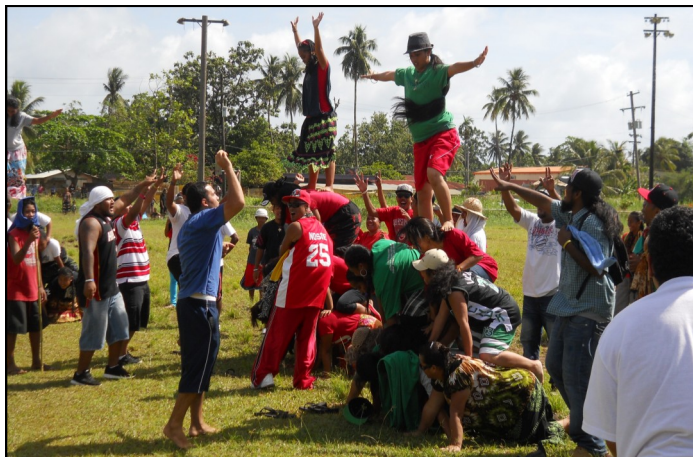
Standing on top of the world