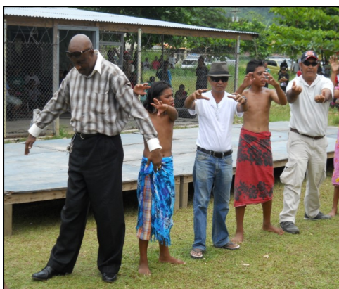
Dancing 100 or Walking 101?