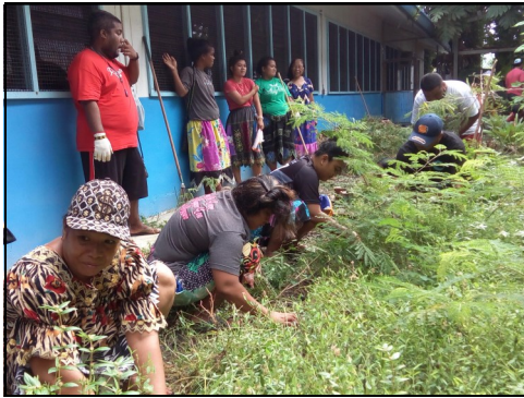
behind Building C