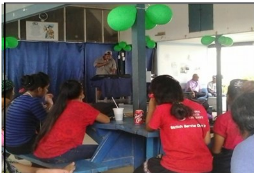
And here were some lazy girls who complained, complained, complained about not getting their food. Did they help the boys cook? Nope! Too lazy — just like itikonenpenichon!

MC Kachuo Matus kept the pace going forward and entertained the hungry troops, while food was prepared for everyone. The party actually began in earnest at 12:30 pm, only half an hour late.