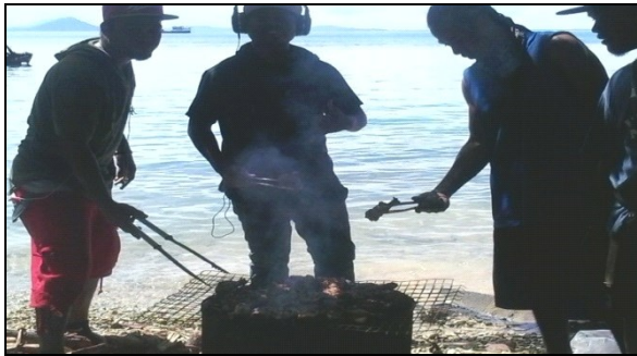
Here were some of our hard-working guys barbecuing chicken and hot dog.