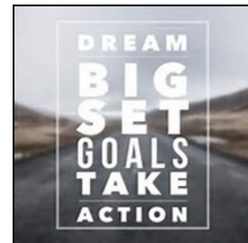
Robert Browning (1812-1889) English poet

Now, instructors. You are called "instructors" because your task is to instruct. You also have a choice — to instruct a little bit, or to instruct a lot. If you instruct just a little bit, then your aim is to earn a salary. If you instruct a lot, then your aim is to help students succeed in life. Choose — and choose wisely. If you aim low, then you do not belong at Chuuk Campus. You are satisfied with minimum achievement of low personal standards. Leave Chuuk Campus. Your goals in life are low, and you will do more harm than help.