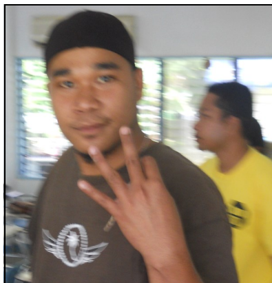
I counted only two instructors .