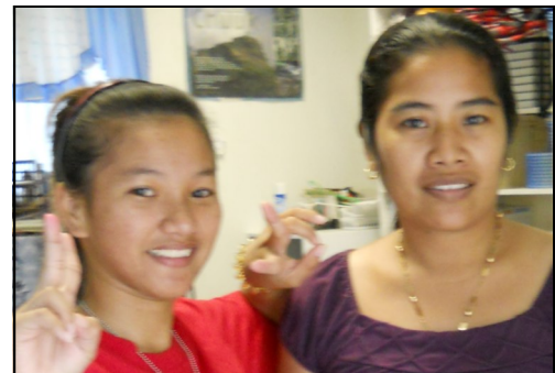
Who you lookin' at? Wanna fight?