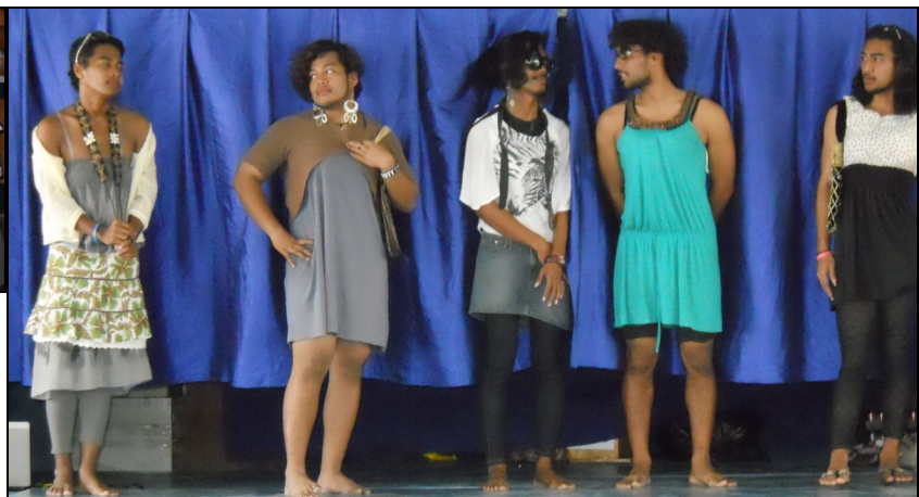
Watch out, girls! Some of our guys on campus are more beautiful than you!