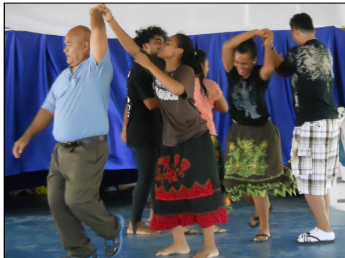
tripping the light fantastic