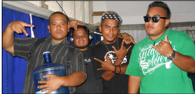
backstage entertainment buffoonery