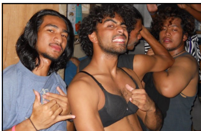
more backstage antics