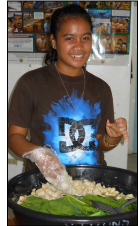
Did you wash your hands before touch- ing the food?