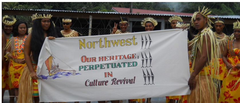
The Northwesterners got it right!