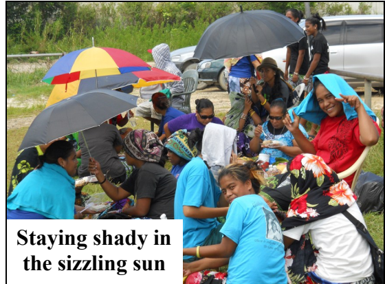
Staying shady in the sizzling sun