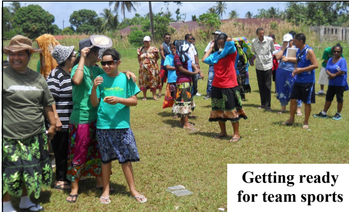
Getting ready for team sports