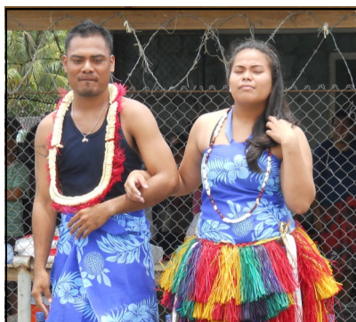
Hail, King and Queen 2013!