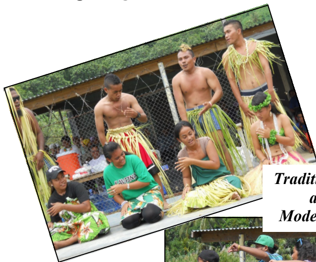
Traditionalists and Modernaires