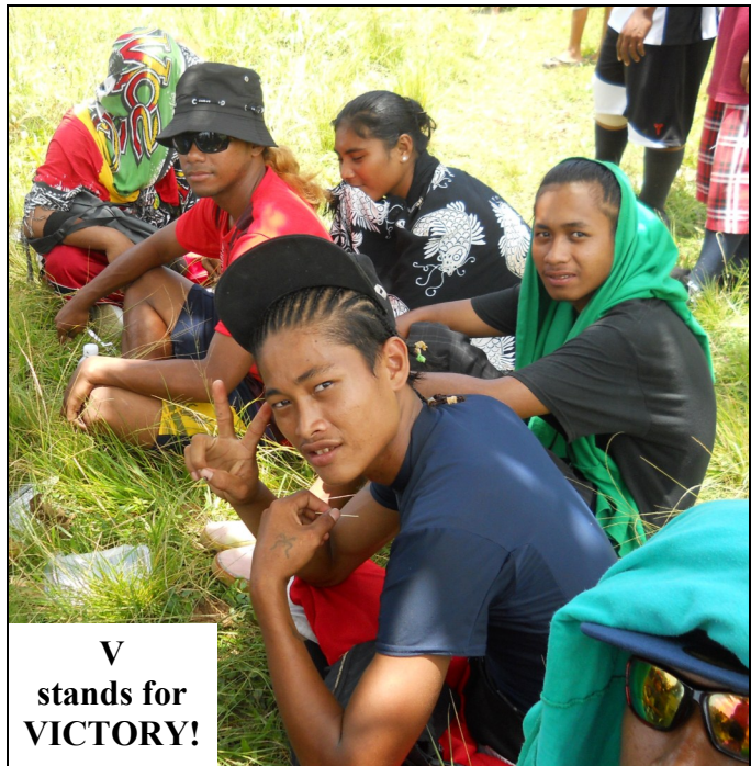
V stands for VICTORY!