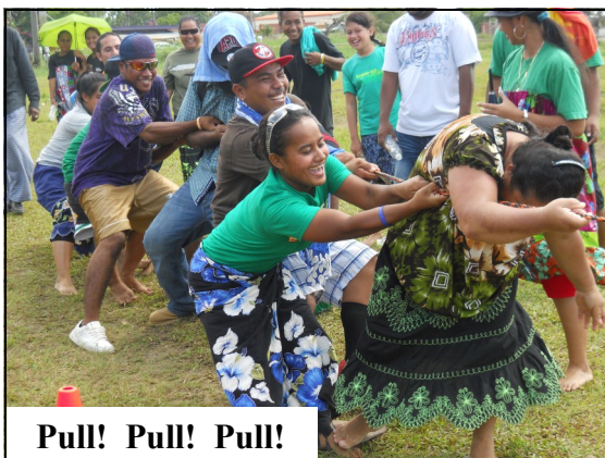
Pull! Pull! Pull!