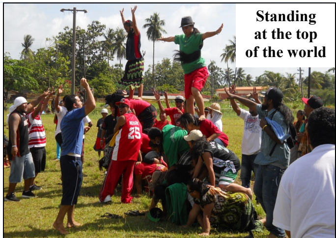
Standing at the top of the world