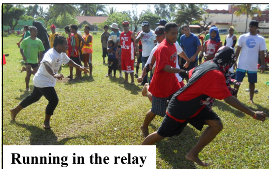
Running in the relay