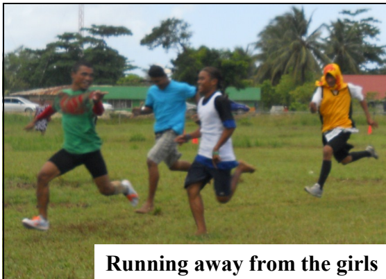
Running away from the girls