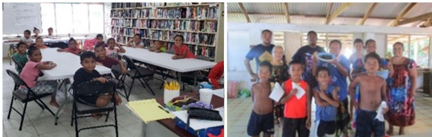
Photo: Children in Yap (left) and Chuuk (right) participating in school intervention programs

School intervention programs in Chuuk and Yap focus on promoting children’s well-being through active programs and providing information about nutrition, health, physical education, and appropriate indigenous knowledge and practices. Childhood obesity continues to be a significant health problem across the Micronesian region.