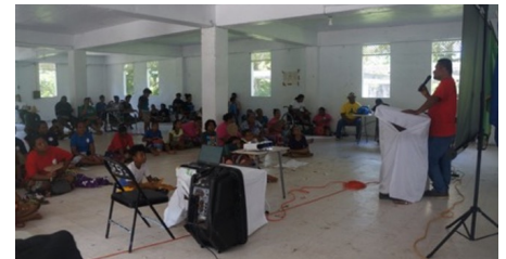
Photo: CRE agent presented on climate change adaption strategies

Extension agents were invited by the Behavioral Health and Wellness program to join in a chartered trip to the Mortlock Islands. Technical assistance, information sharing and public awareness, and hands-on trainings were conducted on various topics including climate change, agroforestry and gardening, food safety, and nutrition. Over 170 youths, women, and men participated the extension activities.