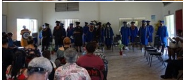
327 Summit Participants