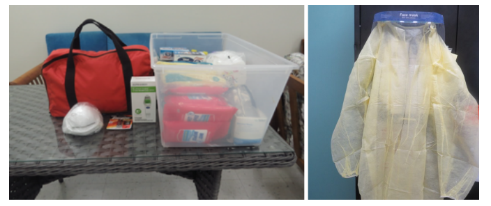
COVID-19 Personal protective equipment (PPE) and supplies in the college's residence halls and designated isolation rooms

There are only 32 students who continue to reside in the college's residence halls. According to the coordinator of the residence halls, "The 32 students represent only 18% of the 176 students who resided in the residence halls during spring 2020 semester and before the global pandemic. Of these 32 students, 14 are male residents, while 18 are female residents." He further added that of these 32 students, 26 are from Yap State and six, from Chuuk State.