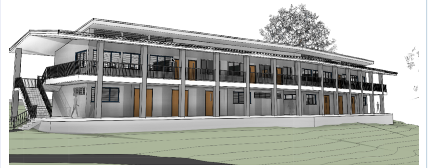
Perspective drawing of the Career & Technical Education Center (CTEC) classroom/Shop Building, Kolonia, Pohnpei