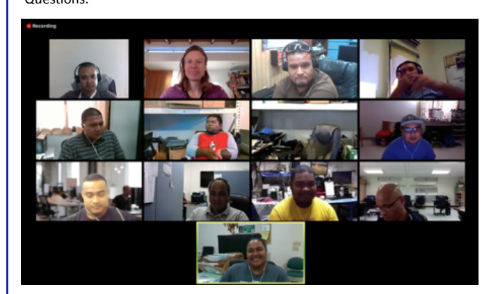
Figure 2.0. Information Technology Office's online training on COVID-19 Preventive

Training on this document has taken place in certain departments, including IT, to: Get to know COM-FSM's COVID-19 Preventive Measures & Framework; Understand Reasons For and Against Wearing Masks; How to Make, Wear, & Clean Cloth Face Coverings; and address Frequently Asked Questions.