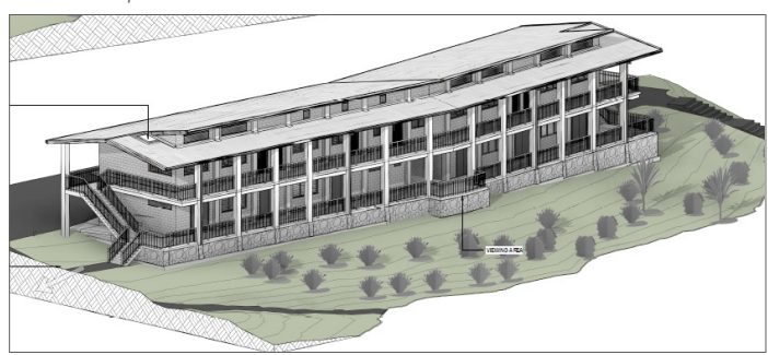
CTEC Multi-Purpose Technical Building